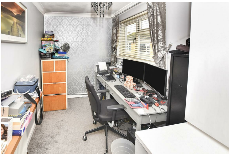
Bedroom Three 11'11 x 6'5 (3.63m x 1.96m)

Low maintenance landscaped rear garden, with a patio covered by timber built gazebo, astro turf area and summer house with power supply. spacious side access and gate to front of property.