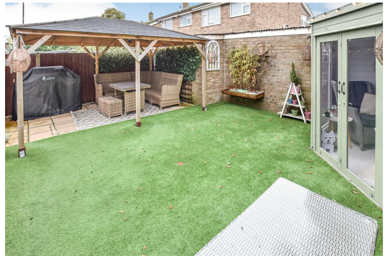
Rear Garden 28'0 x 19'5 (8.53m x 5.92m)

Upvc double window to rear aspect, carpet, coved artex ceiling, fitted wardrobes with sliding doors, radiator, TV and power points.